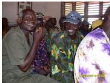
Leaders of conventional cotton farmers group