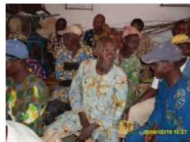
Organic cotton farmers of Glazoué