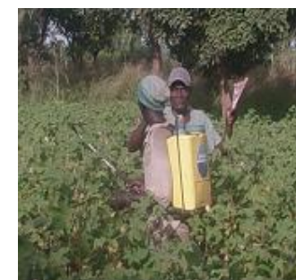
Field agent discussing with farmer