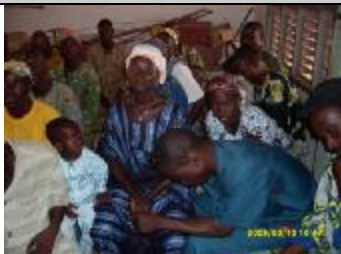
Women participating to Glazoué workshop