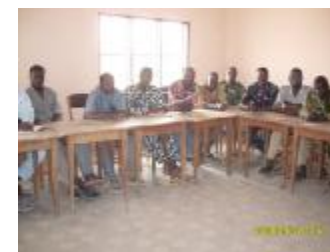
Partial view of men during the workshop