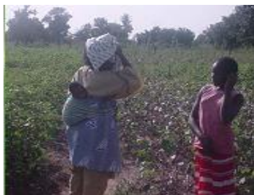
Women in their own organic cotton field