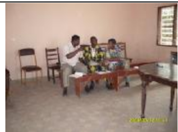
Discussion between CeCPA-Kandi authorities during the workshop