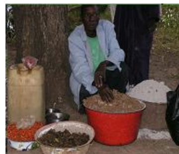
Ingredients for biopesticides processing