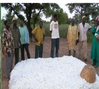
Farmers during cotton harvest