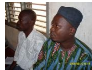
CeCPA-Glazoué authorities at the workshop