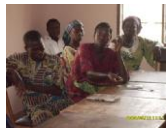
Partial view of women during the workshop