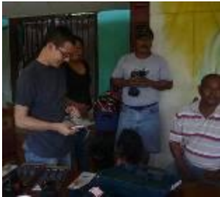
Artisans from Rey Curre receiving tools