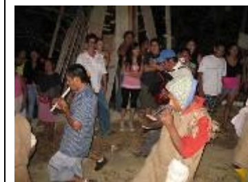
Diablitos celebration at Rey Curré – Iepa documentation, Mask used at the celebration