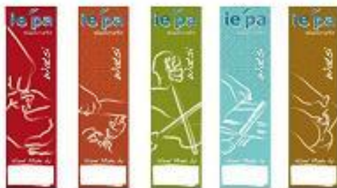
BRANDS & LABELS BY PRODUCT