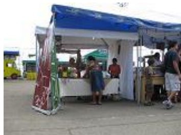
Participation in TRANSAT