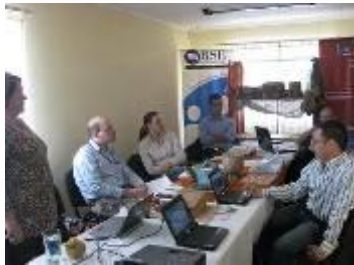
Meeting with Crusa and Fundecooperación at lepa