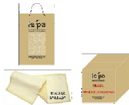
Packing and image for Attaché values