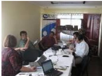
lepa team work meeting