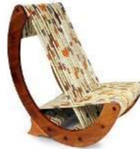
Kekoldi Chair – Silla Kekoldi