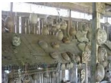
Handicrafts in Rey Curré, Costa Rica