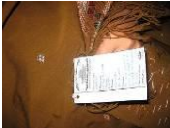
Bhutan products Brand