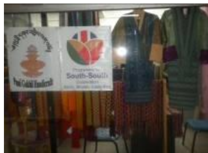
Show room in Thimphu