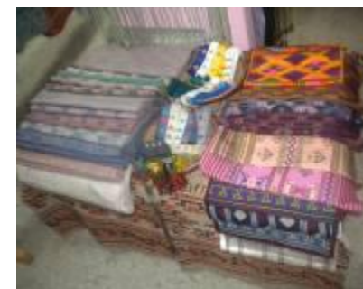
Products in place