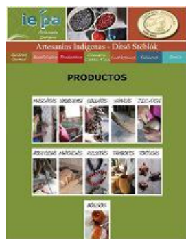
WEB SITE AND PRODUCTS