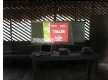
Iepa commercialization workshop