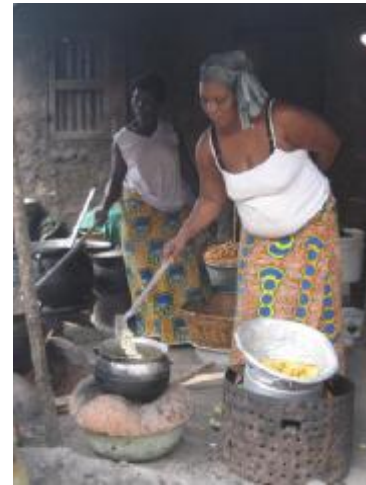
GROUP COFPAGES LABOR CONDITIONS