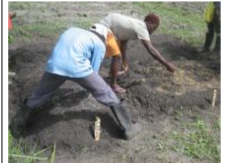
GROUP COJEUSAIN Working the land. Calavi. Benin