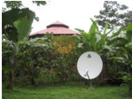
Centro de Capacitación Iriria Alakölpá ú