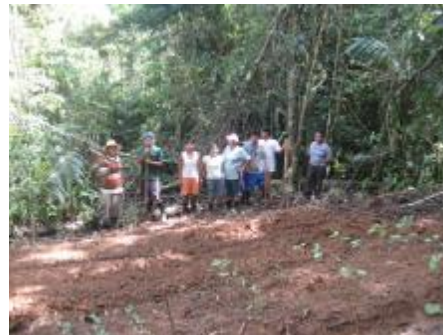
Instalación de huertas Familiares Asociación de Mujeres de Söki