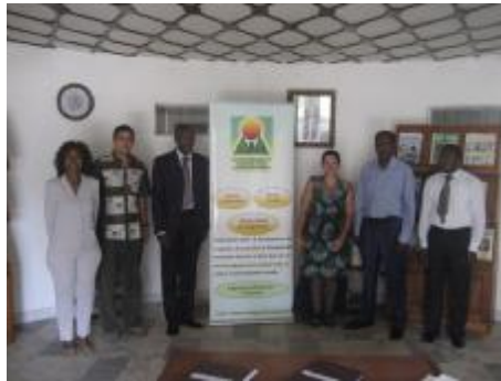
Visit to Benin with GRAD-FB and CEPED