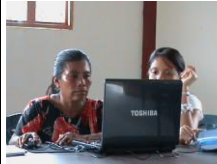
Capacitación en computación Asociación Alakölpá Kanewak Asociación de Mujeres de Söki